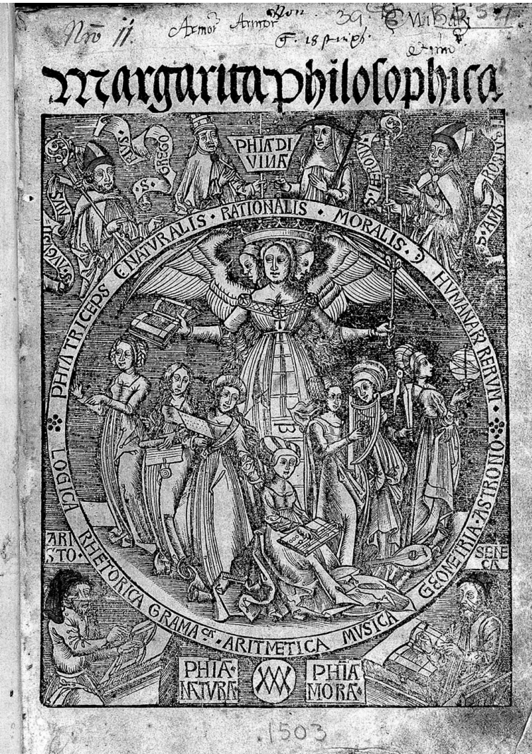
Figure 6.1: G. Reisch, Margarita Philosophica

While I was thus mutely pondering within myself, and recording