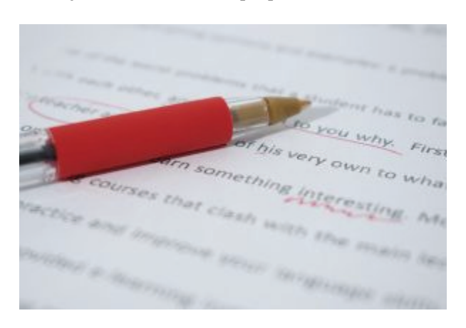
Mark down what you notice.

You will always begin by reading with a pen in hand, underlining and otherwise marking on the text if you own the text or taking notes on a separate piece of paper if you are borrowing the text. If you are reading online, you should get in the habit of annotating your reading experience in some way. You can do this with a digital text editor or PDF editor which allow you to highlight and make notes or comments. Hypothes.is is a free general purpose web and PDF annotator that you can use for that purpose.