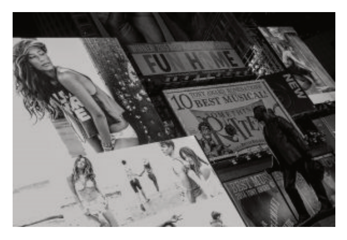
Advertising is hard to escape. Learning to analyze it is a useful skill. From Pixabay.

Then organize the students into groups of 3-5 and have them analyze an unseen text you will provide them in class. Give the students time to compile information using the techniques detailed in this chapter. But rather than have them simply observe what is there, have them develop an opening sentence indicative of a challenging, scholarly reading. Rather than permitting the students to claim "This text is about...", encourage them to begin their examination into the motivations of the author. Require your students to consider why the author is writing, exactly what is at stake, and exactly how the author best conveys this message. Ask the students to produce a sentence following this format: